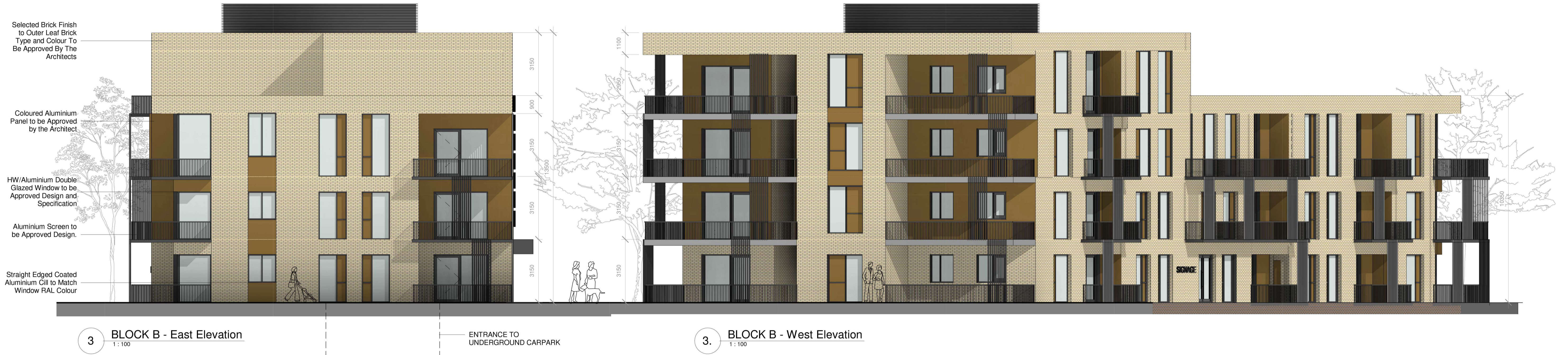
3 BLOCK B - East Elevation 1:100